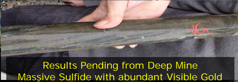
Results Pending from Deep Mine Massive Sulfide with abundant Visible Gold